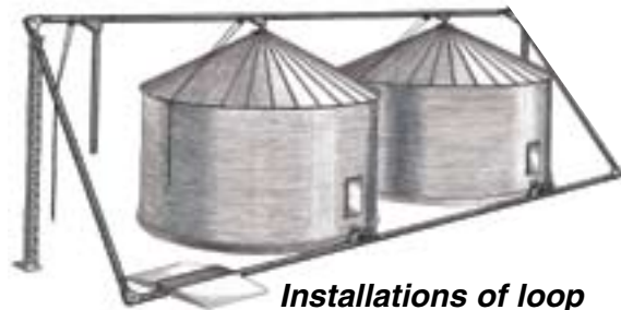
Installations of loop systems with existing bins.