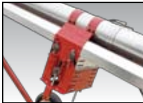
SPRING LOADED TAKE-UP (36' Model)