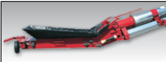
CANVAS HOPPER (35" X 65")

7 1/2" Hopper height with canvas in lowest position