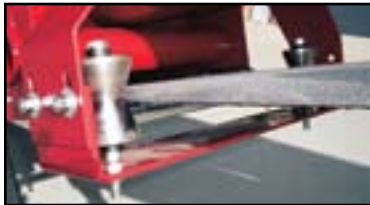
BELT ALIGNMENT ROLLER GUIDE