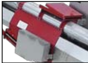
SPRING LOADED TAKE-UP (50' Model)